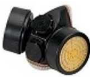
Twin respirator with RC203 cartridges against organic vapors