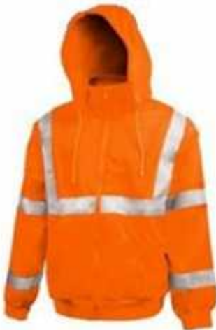
High Visibility Lime Microfiber Fleece Sweatshirt, 10.5oz Spun, Microfiber Fleece Sweatshirt, YKK zipper Closure, 2 Front Pouch Pockets, Detachable Hood with Drawstrings, Elastic Waist and Cuffs, Systems Gear: Zipper System to Allow for Interchangeable Inner Jackets