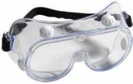
Clear Anti-mist Goggles Indirect Vent