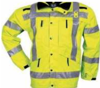
Meets the requirements of ANSI/ISEA 107-2010, Seam sealed construction, Ykk zipper hardware, Made With 3M™ Scotchlite™, Reflective Material, Roll-up detachable hood, Side zip accessibility, Reversible for patrol duty, Zippered exterior hand warmer pockets, Prym snaps