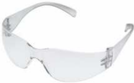
Safety Glasses Stealth 7000 Ultra light weight 301/ASA430C Clear