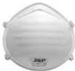
Moulded Dust/Mist Respirator FFP1. Class 1 efficiency (80%) Protection factor 4 Conforms to EN149