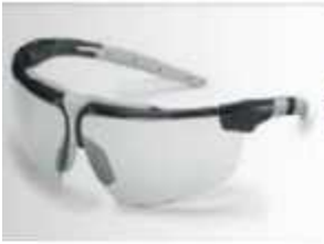
Art. No: 9190.280 Colour: Black / Light grey Lens: PC clear / UV 2C-1.2 uvex supravision HC-AF