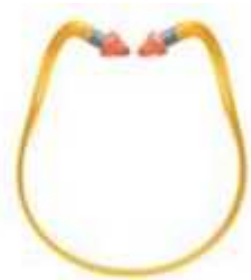
Banded type Earplugs