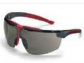
Art. No: 9190.286 Colour: anthracite / red Lens: PC grey / UV 5-2.5 uvex supravision HC-AF