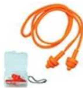
Smartfit Earplugs, reusable With Cord In Plastic Case