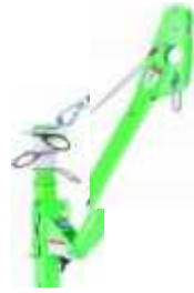
Fall Arrest Davit Arm