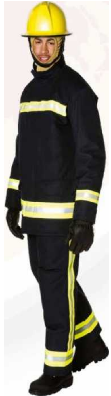
BT/8 Coat, TBT/8 Trousers