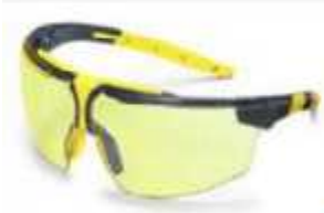
Art. No: 9190.220 Colour: anthracite / yellow Lens: PC amber / UV 2C-1.2 uvex supravision HC-AF