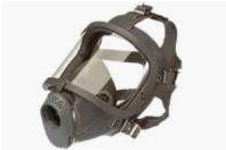
Sari Full face mask Natural rubber. Accepts DIN40 Cannisters. Approvals EN136