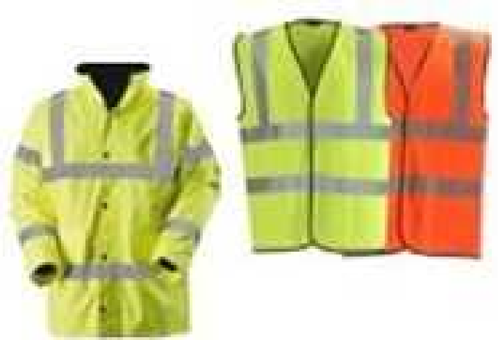
Hi-visual waistcoats, jackets, suits, trousers, in luminous colors with different kinds of reflective tapes.