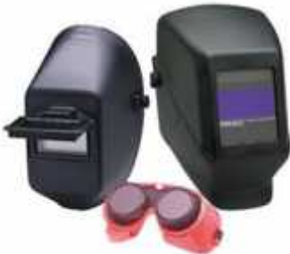
Head mount shield and goggles