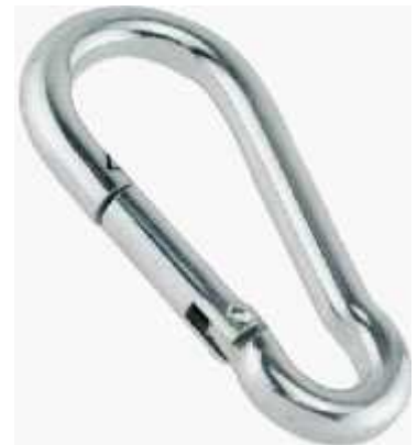
Karabiners and connectors