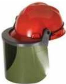
Premium face shield