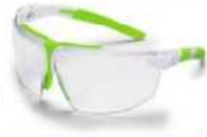
Art. No: 9190.315 Colour: white / lime Lens: PC clear / UV 2C-1.2 uvex supravision performance