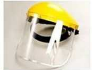
Clear Face shields Impact/ Chemical Resistant