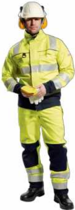
FR61 and FR62 high-visibility flame-resistant garments