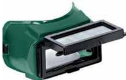
Quality Flip front Glasses